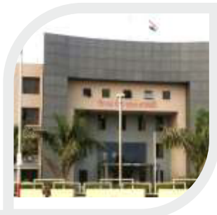
R & B GUJRAT