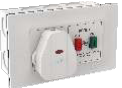
MCB PROTECTED POWER UNIT METAL | PLASTIC ENCLOSURE HSN CODE : 8536