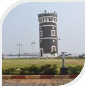
MUMBAI PORT TRUST