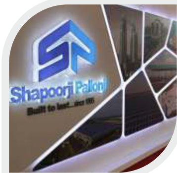
SHAPOORJEE PALLONJI MUMBAI