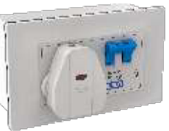
MCB PROTECTED POWER UNIT DP METAL | PLASTIC ENCLOSURE - DP HSN CODE : 8536