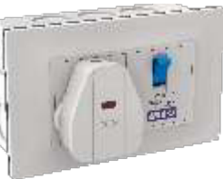
MCB PROTECTED POWER UNIT METAL | PLASTIC ENCLOSURE - SP HSN CODE : 8536