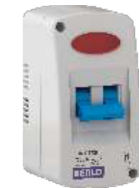
MINI DP MCB IN PLASTIC ENCLOSURE HSN CODE : 8536