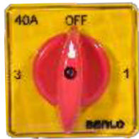
CAM OPERATED ROTARY SWITCH PHASE SELECTOR SWITCH (3 Way with off) HSN CODE : 90283010