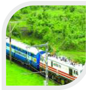
WESTERN & CENTRAL RAILWAY